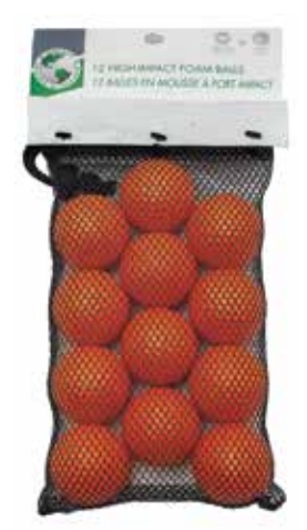
23389 Orange Foam Practice Balls Mesh bag with 12 high-impact foam practice balls