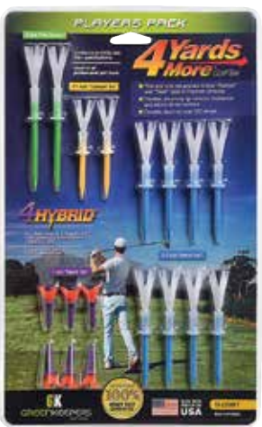
23408 4 Yards More® Players Pack Top selling 4 Yards More tee is now available in an 18-Tee Players Pack which

See Catalog Page 20-21 for all My Hite and FLyTee Packs