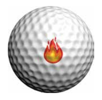
23230 Golf Dotz® Emjoi Flames