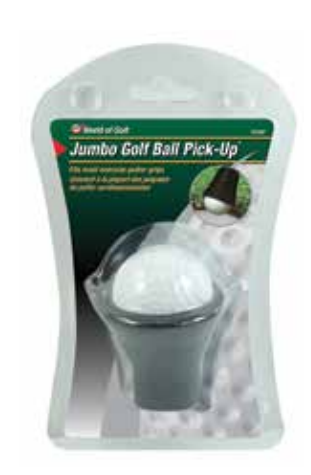
23388 Jumbo Rubber Ball Pick Up Fits most oversize putter grips