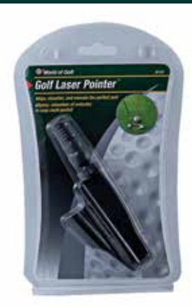
23417 Laser Pointer Helps to check alignment and evaluates putting stroke path