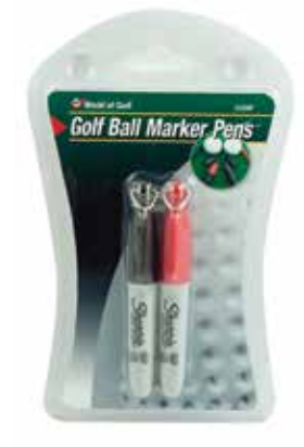
23205 Golf Ball Marking Pens Pack of 2 Sharpie® Mini Markers for easy ball identification