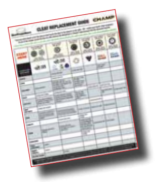
Cleat replacement guide on back of display