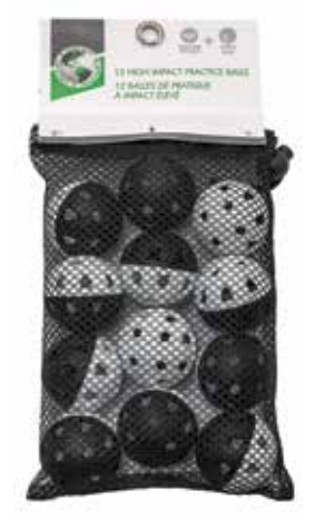
23390 Black/White Practice Balls Pack of 12 high-impact black and white practice balls