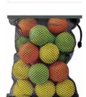
23416 Mesh Bag of 18 Assorted Color Foam Practice Balls