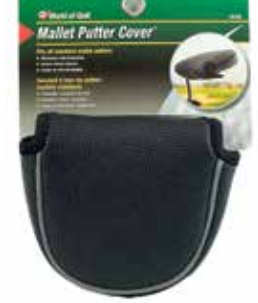
Table Patter Core