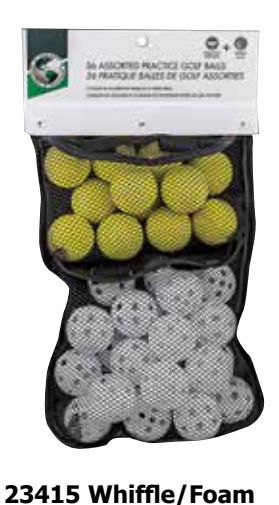
Practice Balls Mesh bag with 24 whiffle and 12 yellow foam practice balls